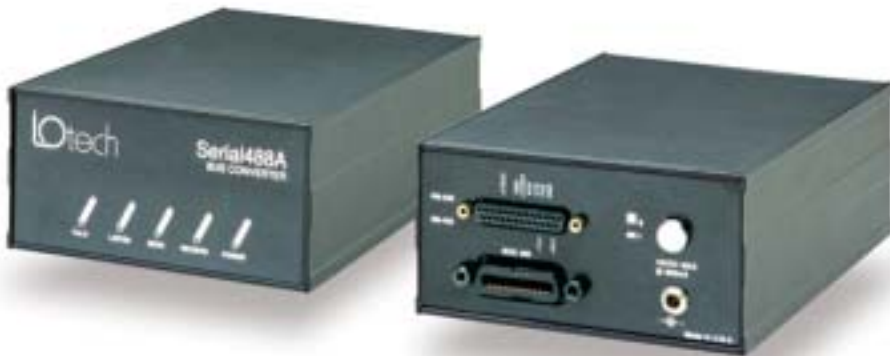
The Serial488A transparently converts between serial and IEEE devices

Connector: Standard IEEE 488 connector with metric studs